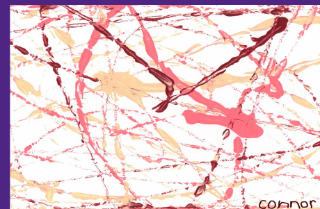
One of Connor Grossman's marble painting projects.